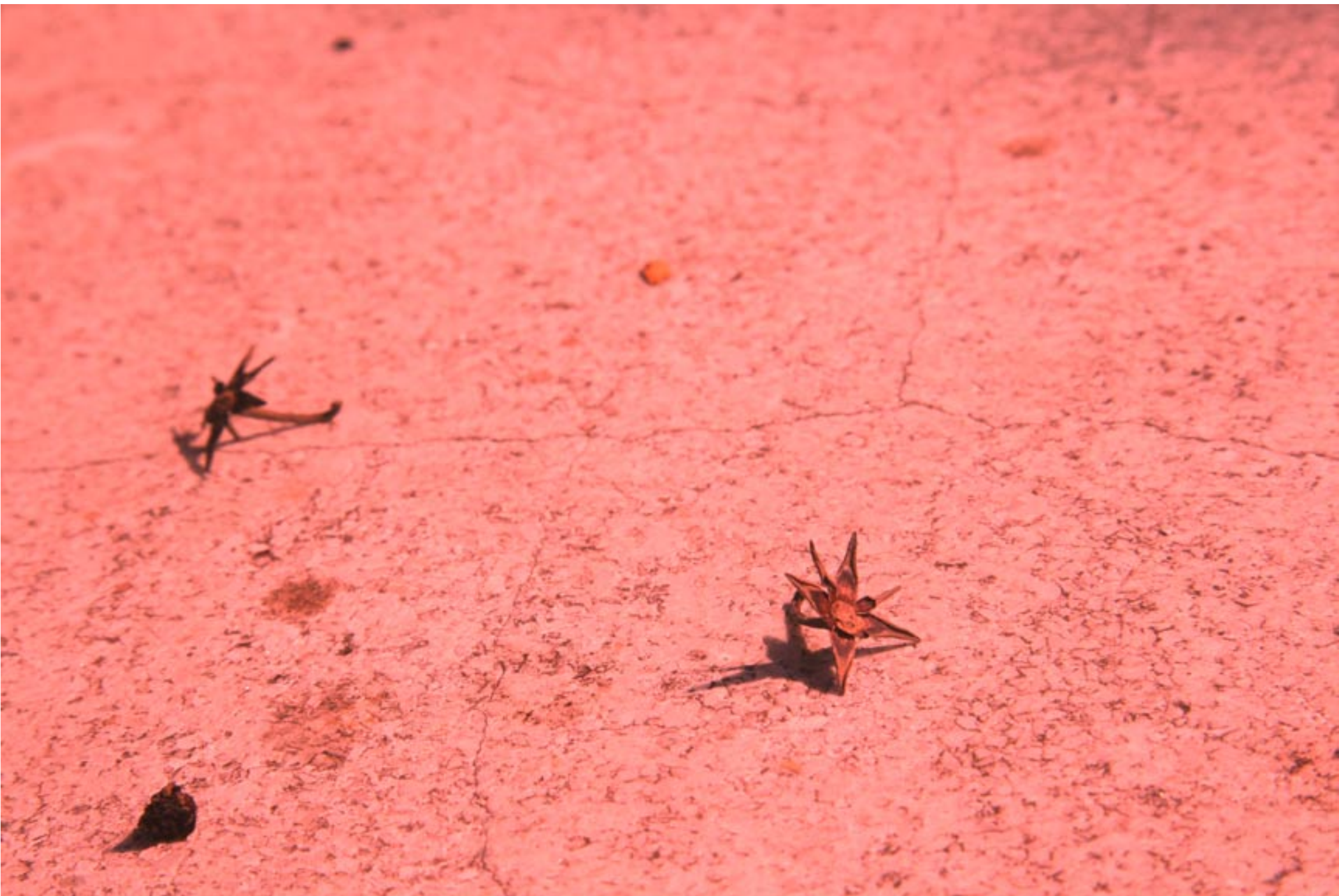
Red ant motherchod meet starfish nation